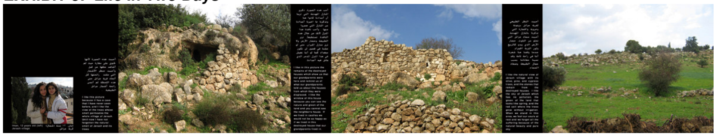
Sample from Life in Two Days