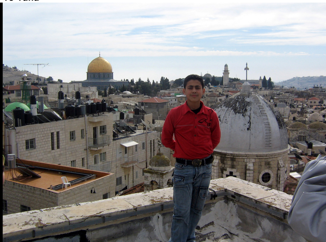
Sample from Return to Yaffa exhibit

I chose this picture because it is my picture that proves that I went to Jerusalem. Behind me you can see Al Aqsa mosque and the Dome of the Rock. Through this picture I want to say that Jerusalem, Al Aqsa, the Dome of the Rock and Palestinians